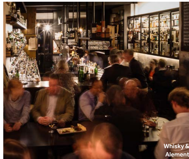
Whisky & Alement

“You’re guaranteed a warm welcome,” says Brooke. “Start your evening with the perfect thirst-quenching beer that will complement the whisky to follow and sate your thirst after a chat with