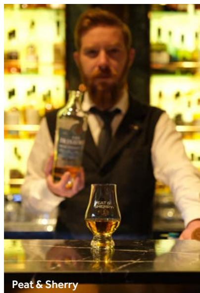
Peat & Sherry